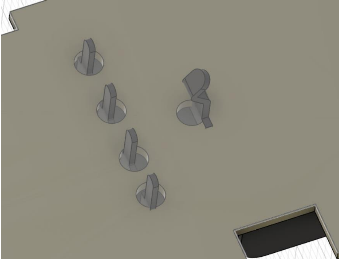
on 3D PCB not aligned and wrong scaling