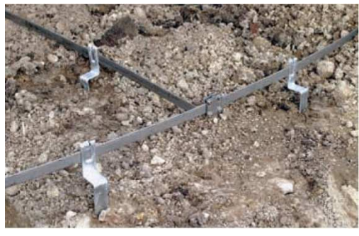
Cross piece/T-piece for stripes