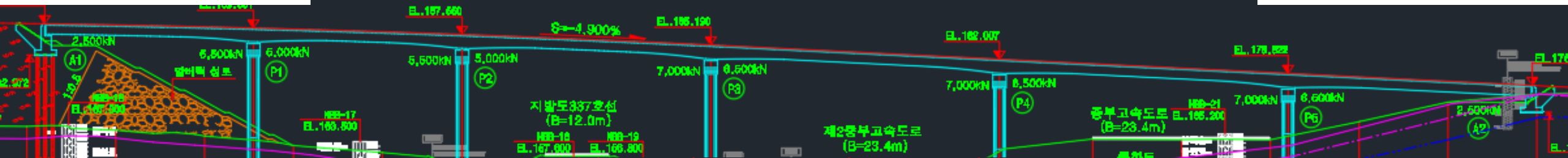
↑ Longitudinal Section