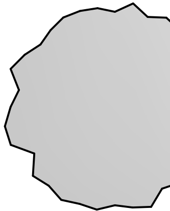
DETAIL H SCALE 0.09 : 1

* QUANTITIES SHOWN ABOVE ARE FOR (1) ASSEMBLY ONLY!! SEE UNIT QTY BELOW FOR MULTIPLES.