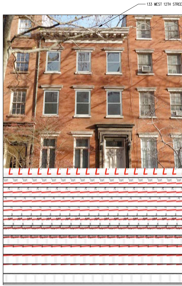
4 PROPOSED BUILDING L-000 NTS