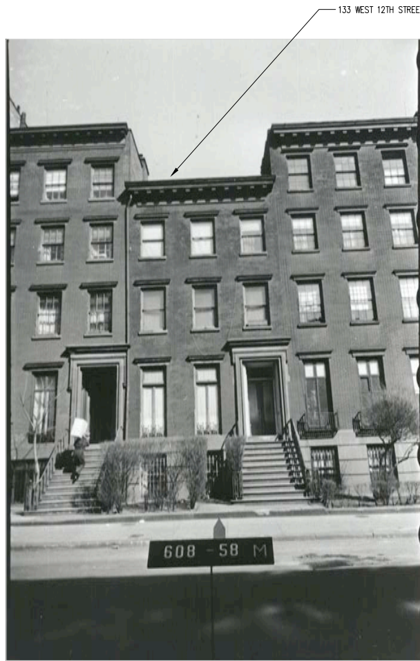
6 HISTORICAL PHOTOGRAPH: 1940 L-000 NTS