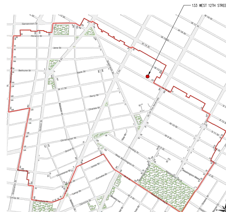
1 GREENWICH VILLAGE HISTORIC DISTRICT L-000 NTS

ARCHITECT MADE architecture MADE Architecture PLLC 141 Beard Street, Bldg 12B Brooklyn, NY 11231 T 718.834.0171 made-nyc.com ALL WORK SHALL BE CHECKED OUT IN ACCORDANCE WITH ALL CODES AND REGULATIONS HAVING JURISDICTION OVER THIS SITE. LOCATION, ALL DIMENSIONS AND INFORMATION SHALL BE CHECKED AND VERIFIED ON THE JOB AND ANY DISCREPANCIES MUST BE REPORTED TO THE ARCHITECT. THESE DRAWINGS MUST NOT BE SCALED. THE DESIGN AND CONTRACT DOCUMENTS ARE THE COPYRIGHT PROPERTY OF THE ARCHITECT AND MAY NOT BE REPRODUCED, ALTERED, OR REUSED WITHOUT THE ARCHITECT'S WRITTEN APPROVAL.