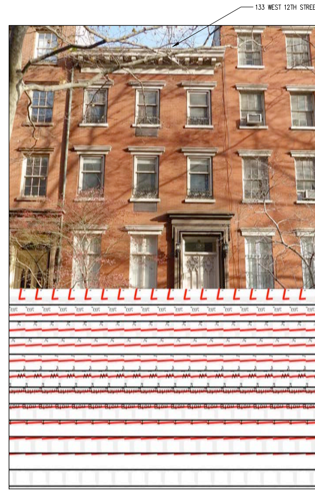
3 EXISTING BUILDING L-000 NTS