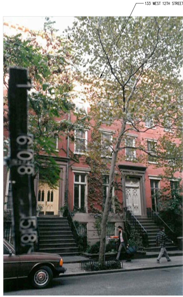
5 HISTORICAL PHOTOGRAPH: 1980 L-000 NTS