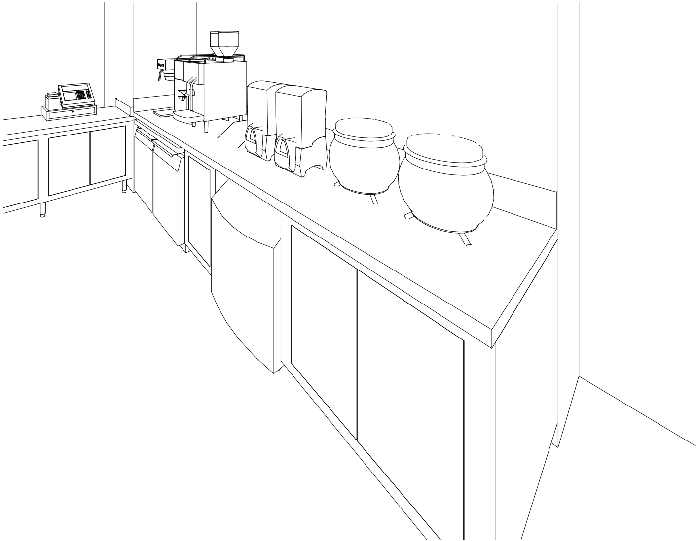
② 3D Rear Counter